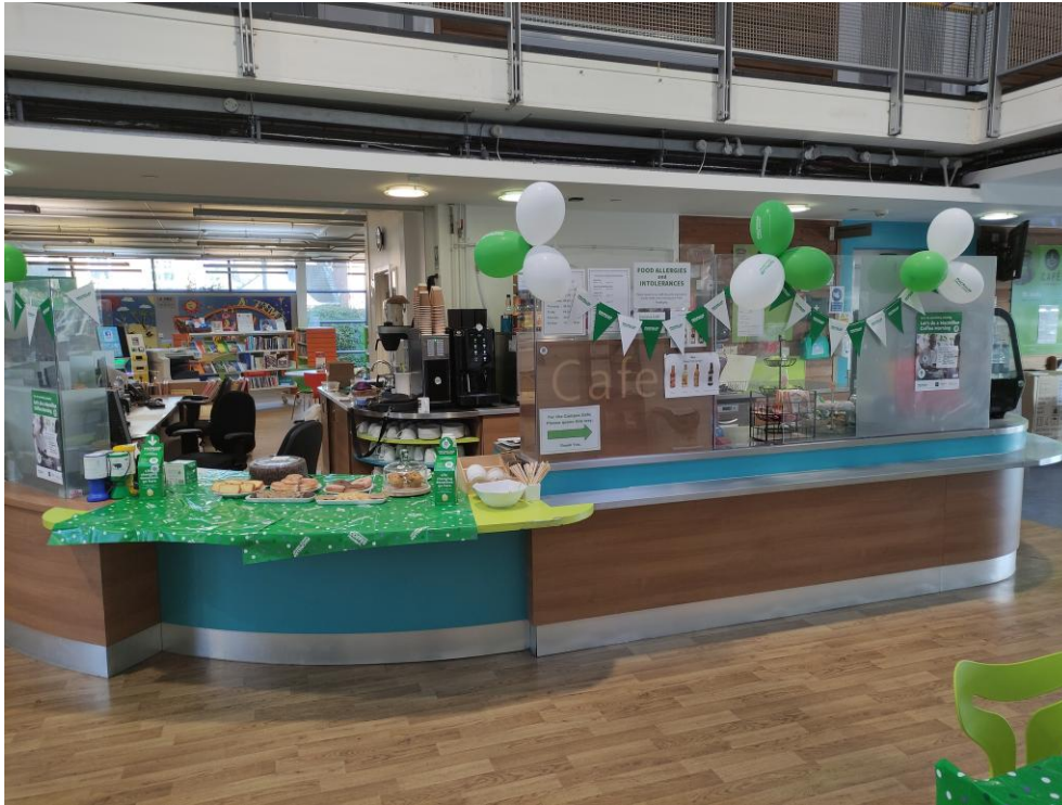
Macmillan Coffee Morning on Friday 26 th September at The Campus